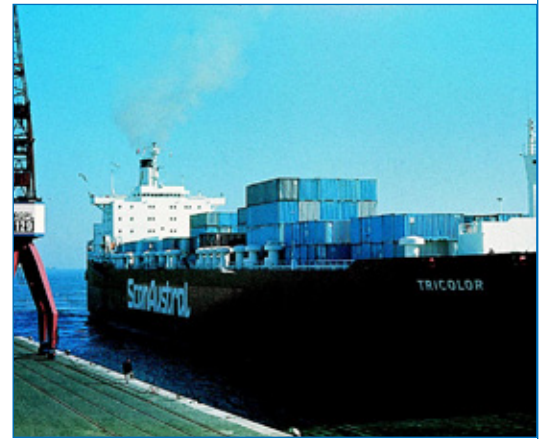
SAMEX runs its own shipping departments.

SAMEX exports to 40 countries including Taiwan, USA and Mexico on a year-round basis. Being based in the southern hemisphere, the company's seasonal availability of product complements demand in the northern hemisphere.