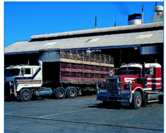
SAMEX consolidates the movement of livestock for both slaughter and live export.