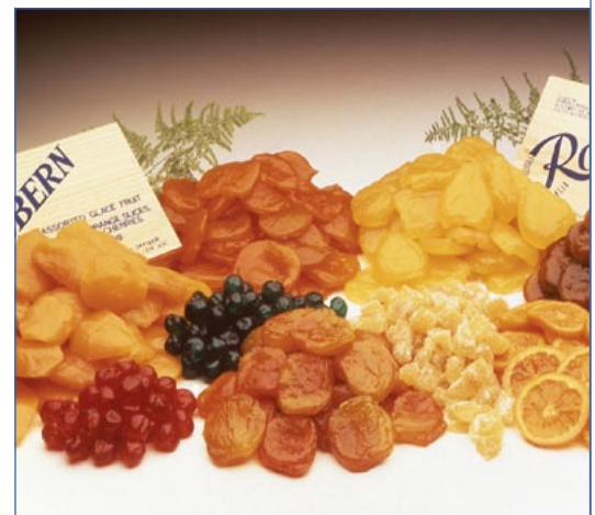
Robern Menz Award winning Glacé Fruit range