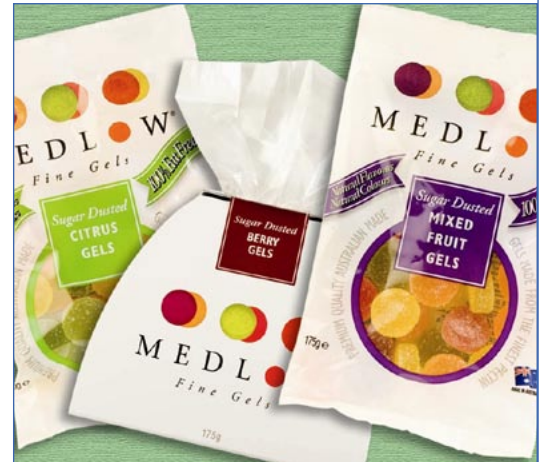
The mouthwatering Medlow range

Robern Menz supplies markets in Japan, China, North America, Europe, Singapore, New Zealand and the Middle East.