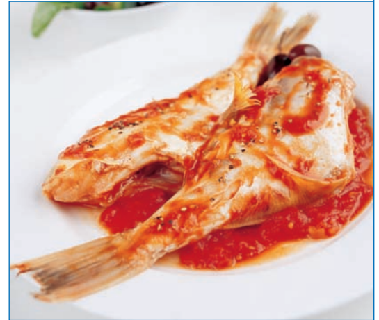
Leather Jacket with Greek Sauce

Red Emperor ( Lutjanus sebae ); Barramundi Cod ( Cromileptes altivelis ); Maori Wrasse ( Cheilinus trilobatus undulatus ); Orange Roughy fillets ( Hoplostethus atlanticus ); Flathead ( Neoplatycephalus conatus ); Moreton Bay Bugs ( Thenus orientalis ); Squid ( Loligo chinensis ); Scampi ( Metanephrops and Nephropsis species); Spanner Crabs ( Rania rania ); Pacific Oysters ( Crassostrea gigas ); Blue Shell Mussels ( Mytilus edulis ) and Octopus species.