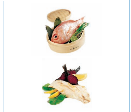
Red bight fish in bamboo. (top), Sea Perch popular with beetroot. (below)