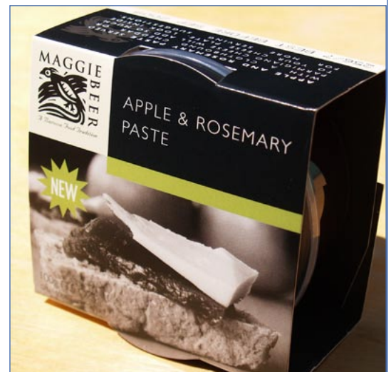
Maggie Beer's Apple and Rosemary Paste.

Maggie was the first in Australia to commercially produce Verjuice. It is made from the juice of unripened grapes and is a gentle acidulant that heightens the flavour of foods. Sangiovese Verjuice is made in the same way using red grapes and is perfect for poaching fruit or using in desserts. Maggie's Read Wine Vinegar is made using the traditional Orleans method. Products are: 750mL Verjuice (2Lt, 750ml, 375ml) and Sangiovese Verjuice (2Lt, 375ml), Aged Red Wine Vinegar (2Lt, 375ml), Vino Cotto (1Lt, 250ml), Fig Vino Cotto (250ml).