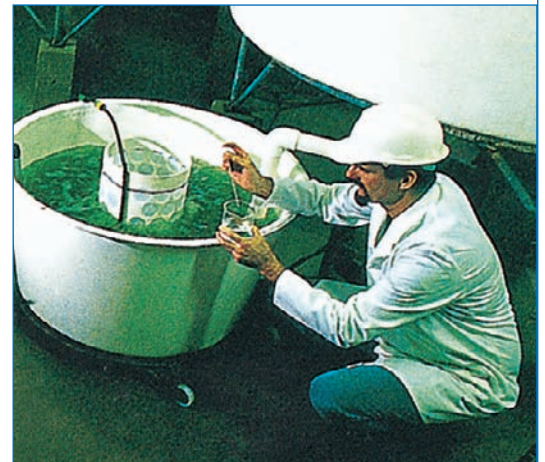
Qualified aquaculture personnel conduct daily tests of the growing environment.

Australian Hiramasa™ is currently focussing its exports to the Japanese Sashimi market, America and European countries.