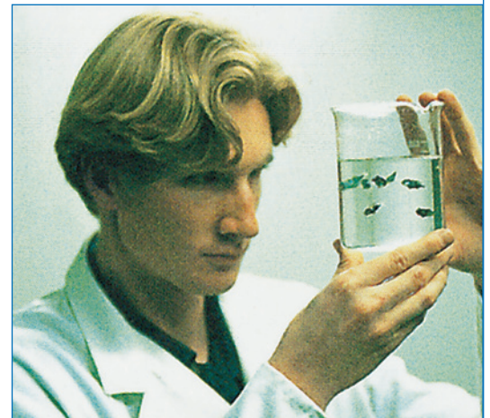
Continuous monitoring is part of the company's culture.