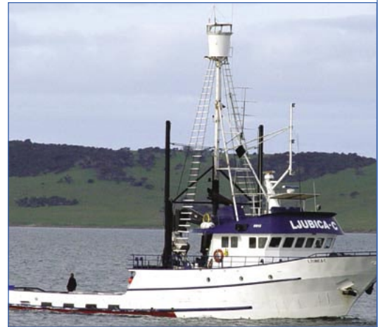
Tuna are harvested from pristine ocean waters.

In these ways, the Australian tuna ranching industry can deliver to customers the unique taste, texture and quality of this product. The benefits of a pristine ocean growing environment and the very best rearing and handling conditions can be seen, tasted and enjoyed.